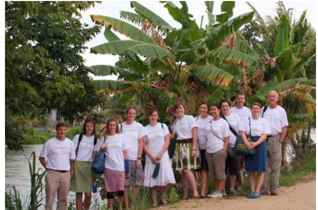
USF Teacher Assistants & PLB staff: January, 2009

In addition to the learning that occurred in working with the Belizean teachers and school children, the USF student teachers had opportunities to dialogue with members of the