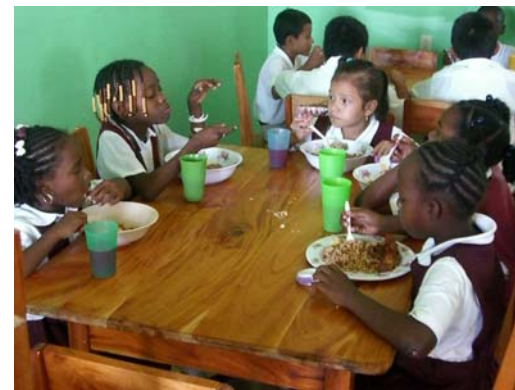
AFTER: new walls & ceilings; preparation/serving tile counters; individual mahogany tables & chairs; granite tile flooring; butane gas tanks moved outside

Project Learn Belize has expanded its understanding of "benefactor" to include the contributed services of volunteers who have joined us on various trips, doing major repairs and painting at the school. From a rewired school bell to the design and construction of much-needed storage cabinets around the campus, these volunteers have poured both talent and heart into anything that required attention.