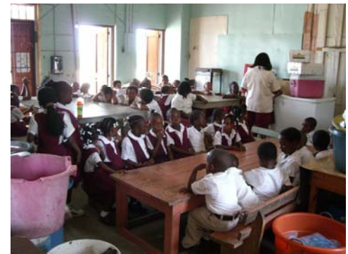
BEFORE Kitchen / Cafeteria Renovations: Old classroom; no separate kitchen area; exposed butane tanks; plywood tables & benches; crumbling concrete floors