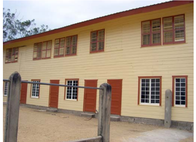
Abandoned building becomes 5 new classrooms & Principal's Office

+ In addition to school supplies and books, we continue to maintain and upgrade the school's computer center (originally created by previous donations from USA), as well as the purchase of overhead projectors and a new copier machine.